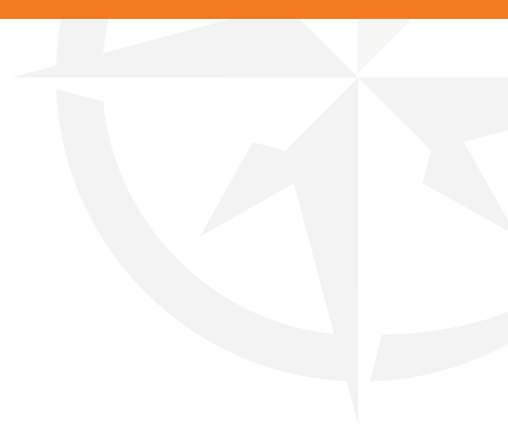
TABLEAU AND R CUSTOM INTEGRATION